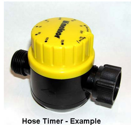
Hose Timer - Example

Now that we have the principles, let's see how to implement a "fail safe" design. First, make a schematic of your system, which is a simple picture of all the components that are part of your system and that might cause a problem. Next make a list of how potential problems might occur and how these failures might be avoided or compensated for. Then choose the failures that are most likely and the ones that can cause a disaster, and choose practical ways to preclude or compensate for those eventualities. Then do it!