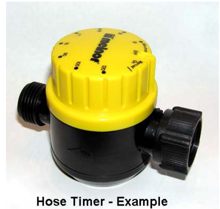
Hose Timer - Example

Now that we have the principles, let's see how to implement a "fail safe" design. First, make a schematic of your system, which is a simple picture of all the components that are part of your system and that might cause a problem. Next make a list of how potential problems might occur and how these failures might be avoided or compensated for. Then choose the failures that are most likely and the ones that can cause a disaster, and choose practical ways to preclude or compensate for those eventualities. Then do it!