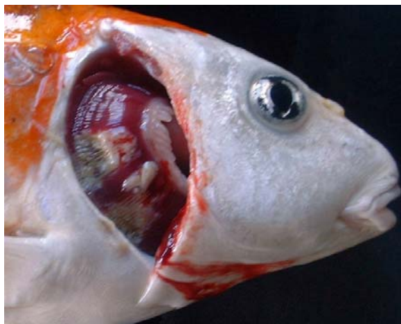
Figure 1. Necrotic gills